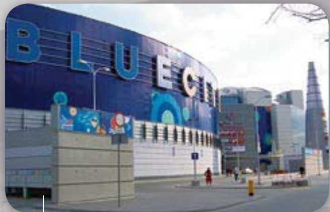
Blue city I | Warsaw AlkorPlan® F - 2003