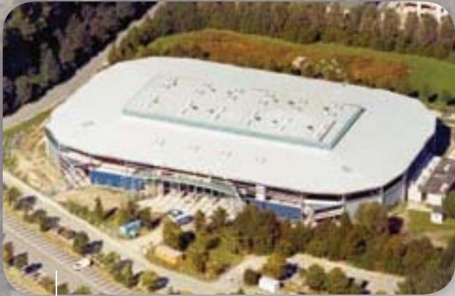
Vlaams wielercentrum Eddy Merckx | Gent (B) AlkorPlan® F - 2005