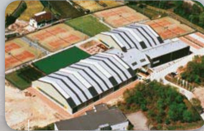
Sporthal "De Wolfkamer" | Huizen (NI) AlkorPlan® F - 1998