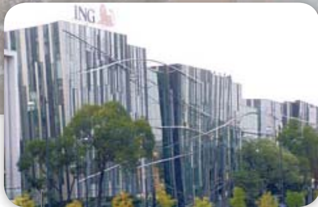
ING Center | Budapest AlkorPlan® F - 2002