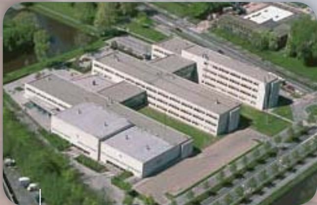
Van Egmond College | Purmerend (NL) AlkorPlan® L - 1995