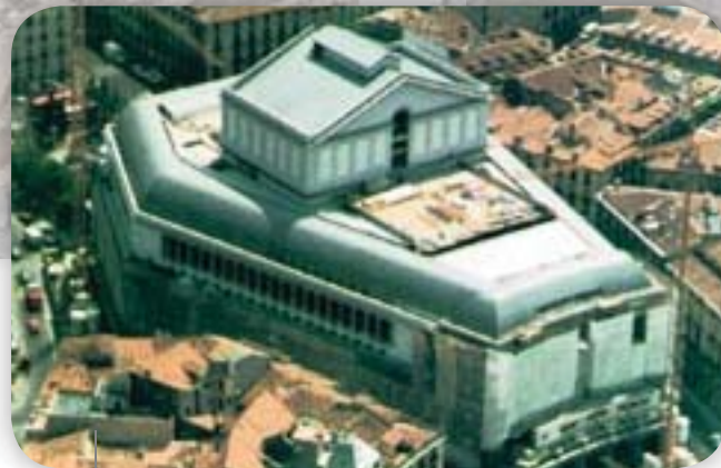
Teatro real | Madrid AlkorPlan® L - 1992-1993