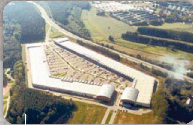
Shoppingcenter | Arlon (B) AlkorPlan® F - 2004