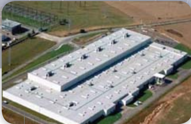
Futuba | Havlíčkův Brod AlkorPlan® F - 1980