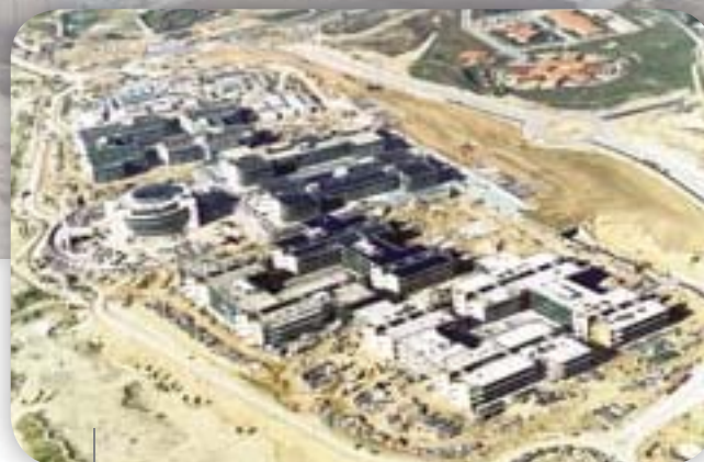
Ciudad Financiera | Madrid AlkorPlan® L - 2005