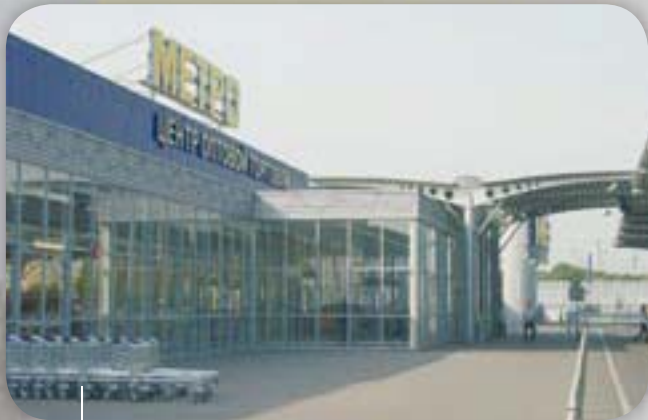
Metro Shopping Center | Moscow AlkorPlan® F - 2003