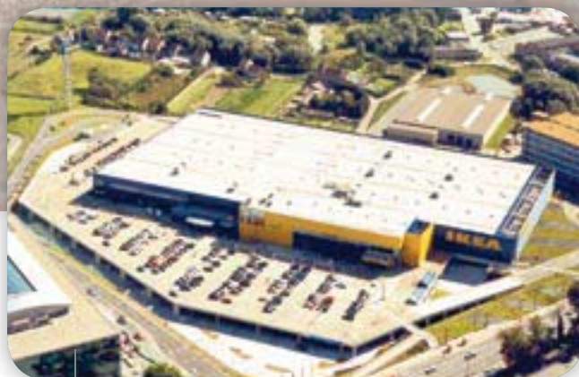
Ikea | Anderlecht (B) AlkorPlan® F - 2004