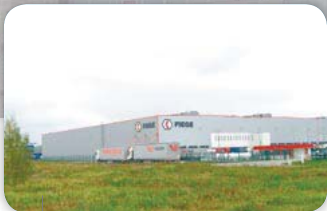
Fiege I | Mszczonow AlkorPlan® F - 2004