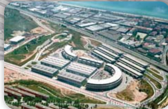
Les Guixeres | Badalona AlkorPlan® F - 2002-2004