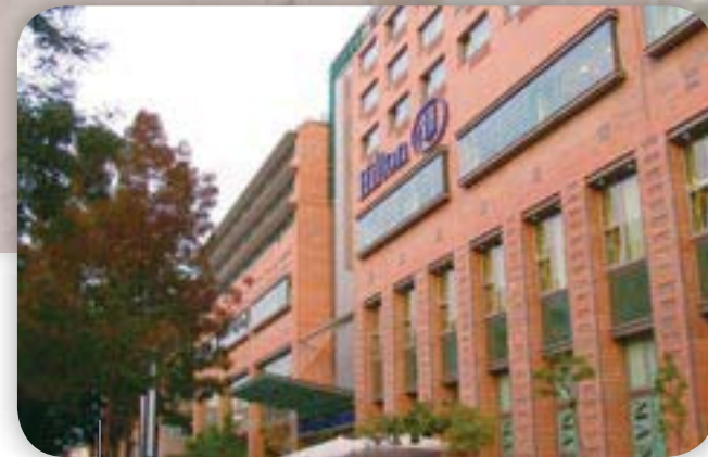
Hilton Westend | Budapest AlkorPlan® L - 1999