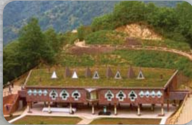
Centro de Interpretación de la Naturaleza | Muniellos AlkorPlan® L - 2003