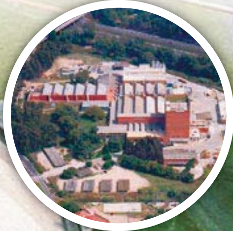
RENOLIT Production unit Sant Celoni (Spain)