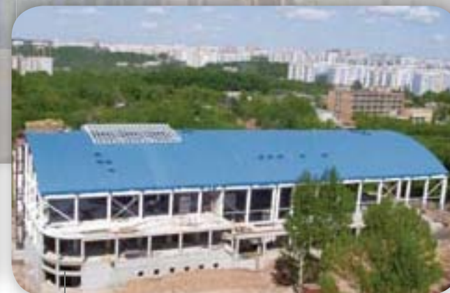
Sports Center | Samara AlkorPlan® F - 2001