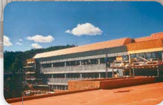
Office Building | Tønsberg (Dk) AlkorDesign® - 2000