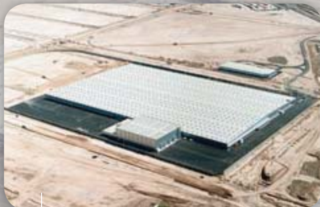
Zara Logistics Center | Zaragoza AlkorPlan® F - 2002 (ca. 114.000 m 2 )