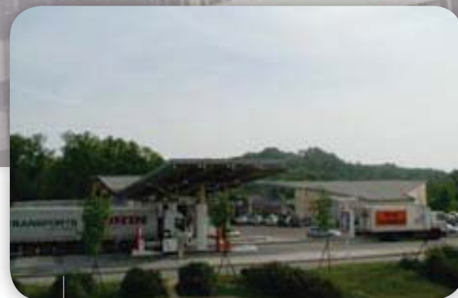
Station Total | Corrèze AlkorDesign® - 2002