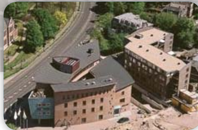
ING Bank | Amersfoort (NI) AlkorDesign® - 1998