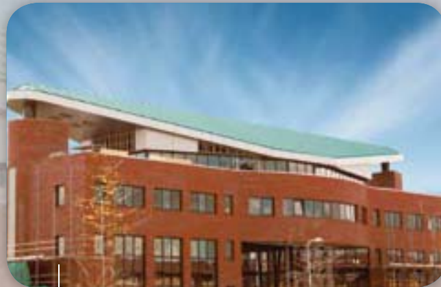
Kantoren | Capelle aan de IJssel (NL) AlkorDesign® - 2005