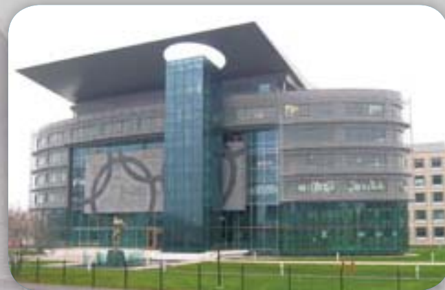
Olympic Center I | Warsaw AlkorPlan® F - 2004