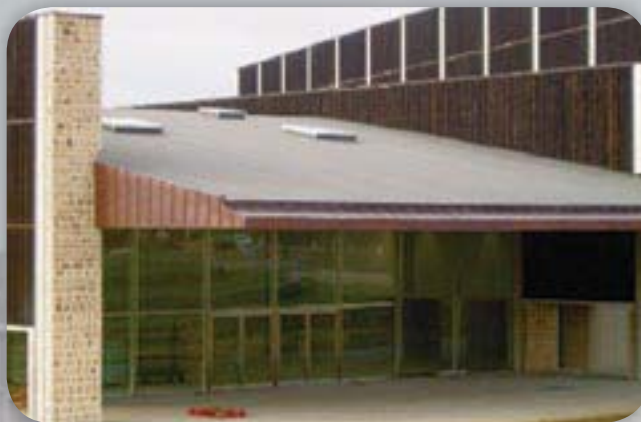
Bocapole | Bressuire AlkorPlan® F - 2004