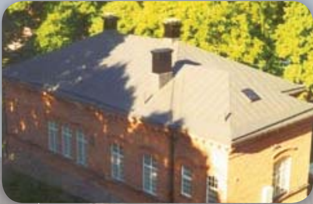
Office Hospital | Stockholm (Se) AlkorDesign® - 2000