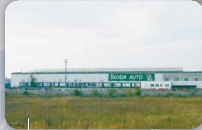
Škoda Auto | Mladá Boleslav AlkorPlan® F - 1995