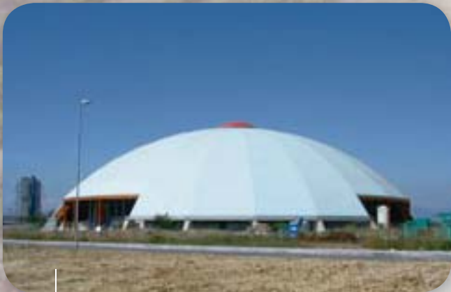
Palazzo dello sport | Livorno AlkorPlan® F - 2003