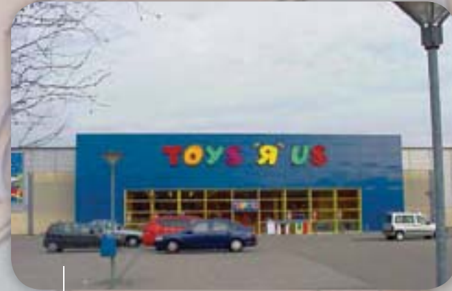
Toys "R" us | Greve (Dk) AlkorPlan® F - 2004