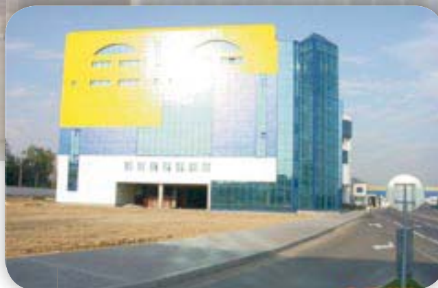
Podvorie-office/shopping centre | Minsk AlkorPlan® F - 2005