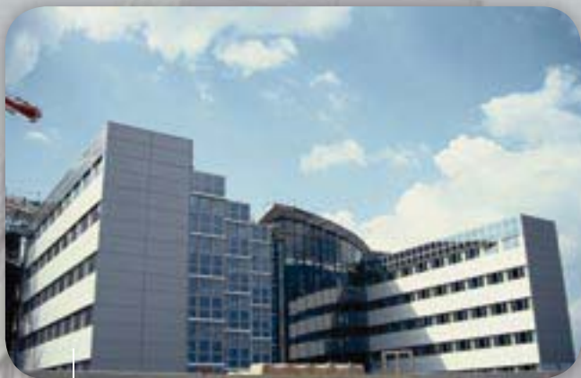
Airbus Industries | Blagnac AlkorPlan® F - 1993