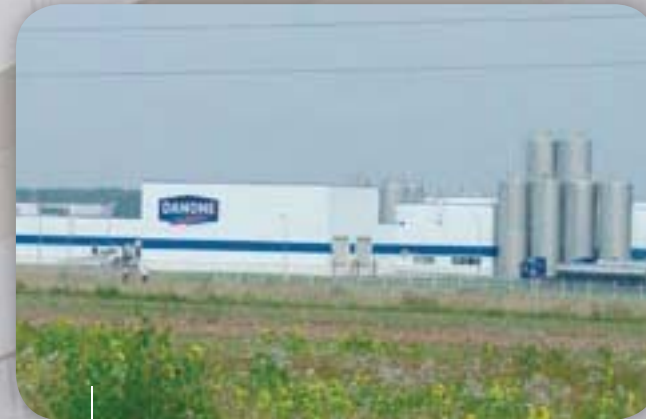
Danone | Moscow AlkorPlan® F - 2002-2003