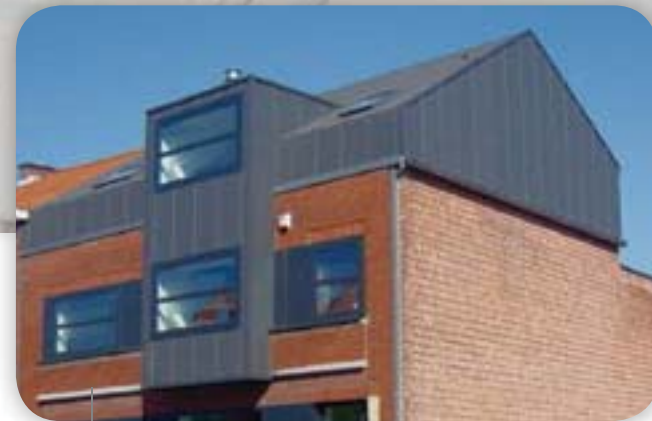
Privé woning | Tongeren (B) AlkorDesign® - 2003