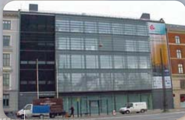
Design Center | Copenhagen (Dk) AlkorPlan® F - 1999