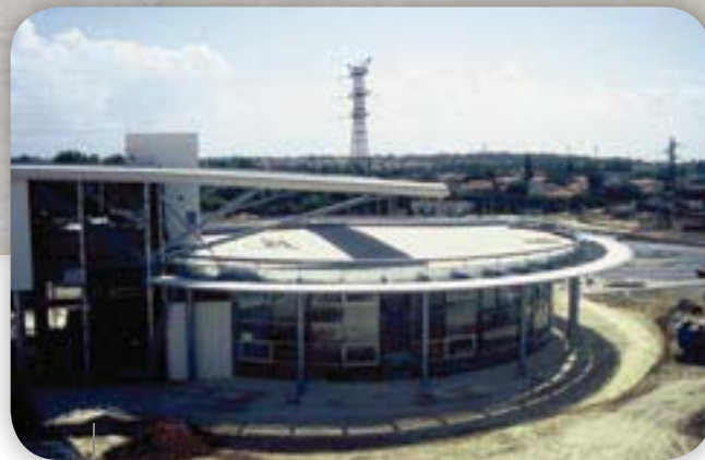
Lycée Champlain | Royan AlkorPlan® F - 1998