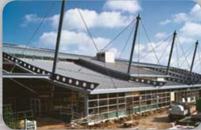
Da Vinci College | Gorinchem (NI) AlkorDesign® - 2000