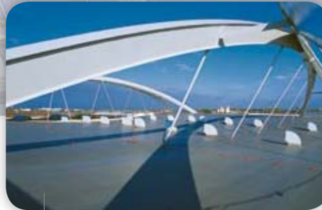
Transport Station | Praha AlkorFlex® L - 1994