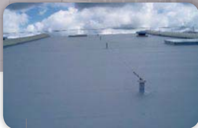
Plastic Omnium | Le Havre AlkorPlan® F - 2004