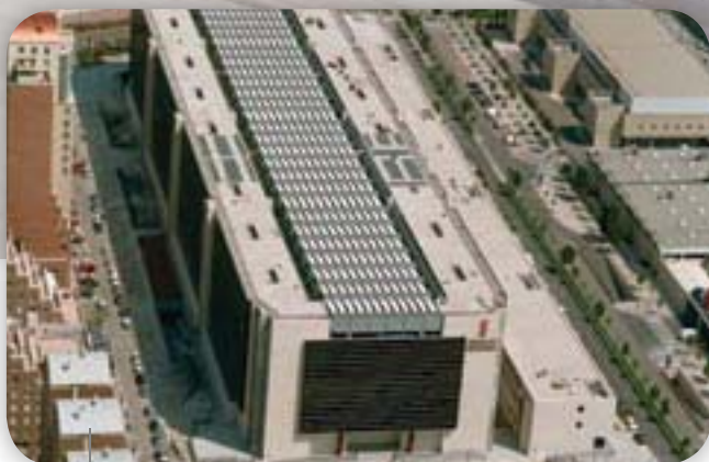
Ciudad de la Justicia | Valencia AlkorPlan® L - 2002-2003