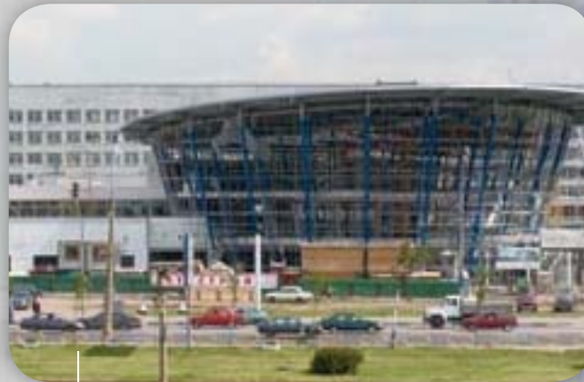
Mercedes Benz | Moscow AlkorPlan® F - 2002