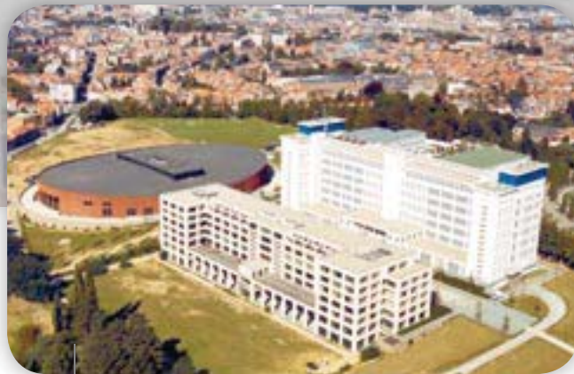
Sportplaza | Leuven (B) AlkorPlan® F - 2005