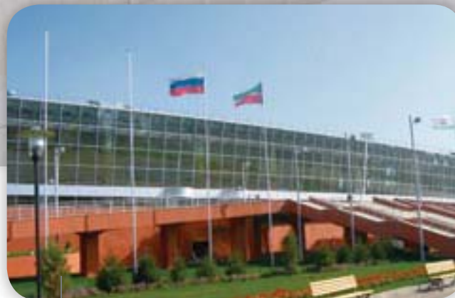
Hipodrom- Horse race stadium | Kazan AlkorPlan® F - 2005