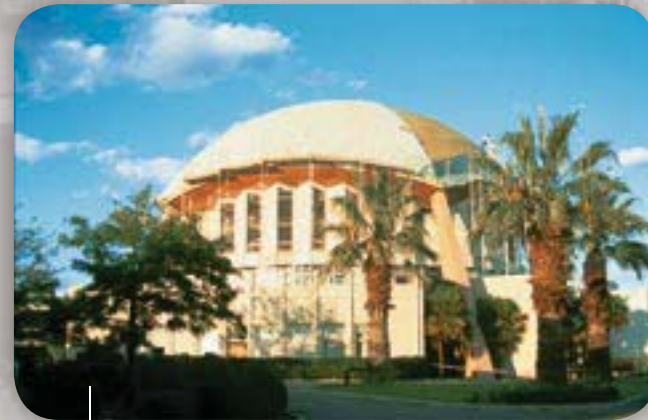
Théâtre CNRO | Foelli AlkorPlan® F - 1994