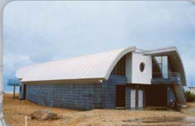
Ecole de Voile | Courseuil-sur-Mer AlkorDesign® - 1997