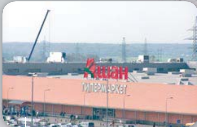
Auchan | Moscow AlkorPlan® F - 2003