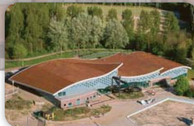
Zwembad "Het Keerpunt" | Zoetermeer (NL) AlkorPlan® F - 1998