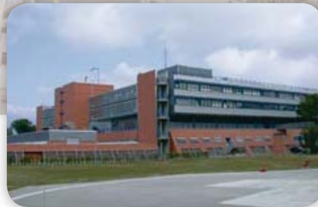
Ospedale della Versilia | Viareggio AlkorPlan® F - 2006