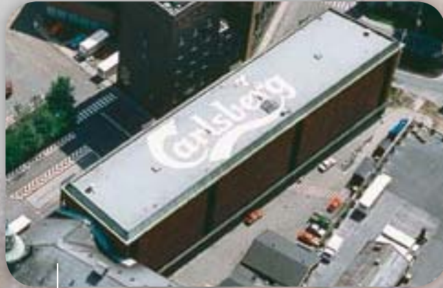
Carlsberg Brewery | Copenhagen (Dk) AlkorFlex® - 1996