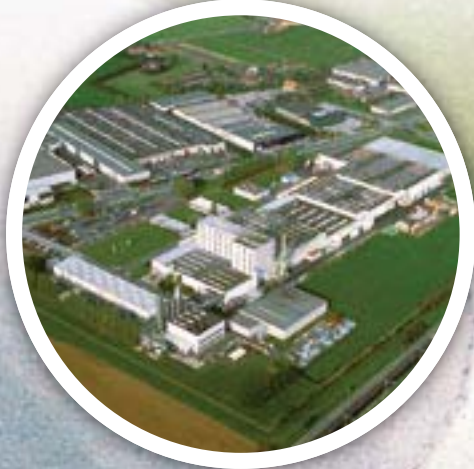
RENOLIT Production unit Oudenaarde (Belgium)