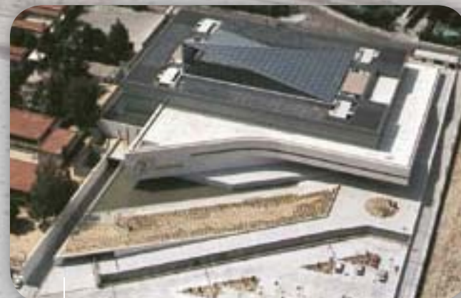
Edificio telefónica | Madrid AlkorPlan® L - 2000