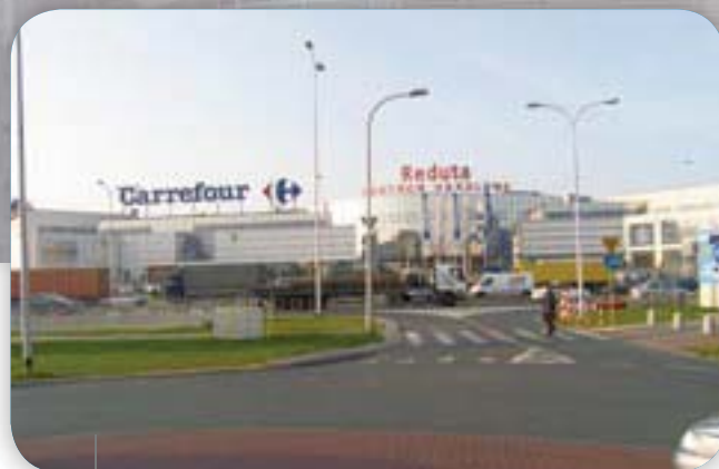
Shopping Center Reduta II | Warsaw AlkorPlan® F - 2004