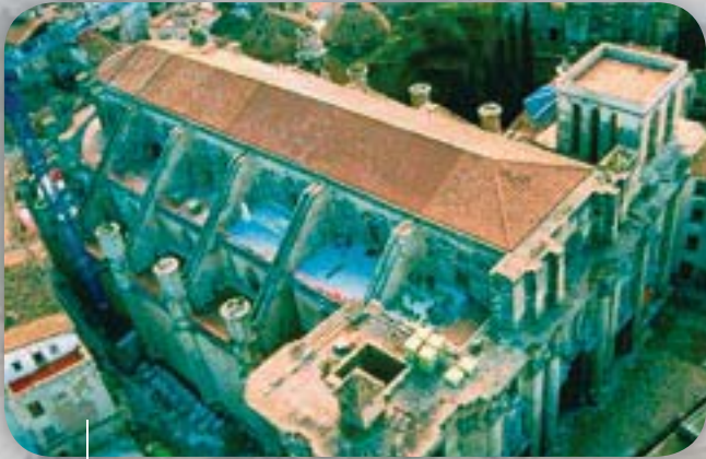
Catedral de Tortosa | Tarragona AlkorPlan® F - 1998