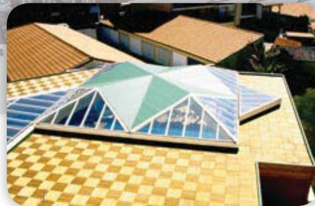
Restaurant Deleuil | Lacanau AlkorPlan® L - 2001