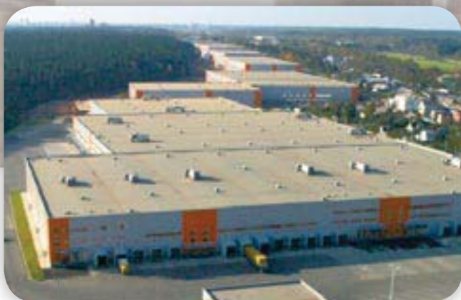
Warehouse complex MLP | Moscow region AlkorPlan® F - 2006 (ca. 200.000 m²)