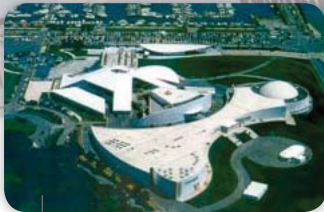
Océanopolis | Brest AlkorPlan® A - 2000