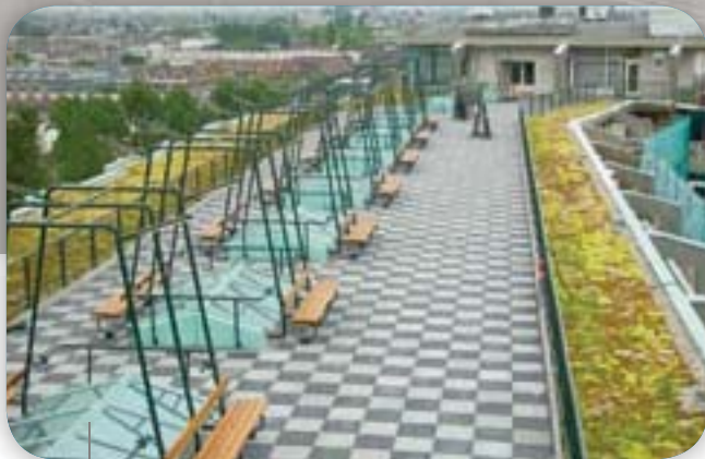
Groothandelsgebouw | Rotterdam (NI) AlkorPlan® L - 2005