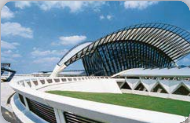
Gare Aéroport Satolas | Lyon AlkorPlan® F - 1995