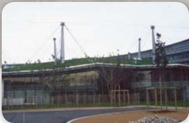
Cité Scolaire Internationale | Lyon AlkorPlan® L - 1993