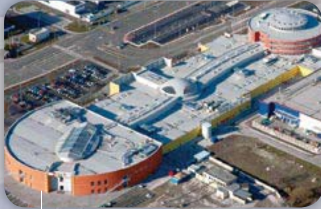
Soravia | Bratislava AlkorPlan® F - 2004