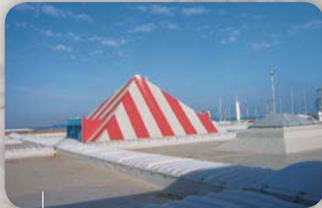
Mercato Ittico | Viareggio Lucca AlkorPlan® F - 2005