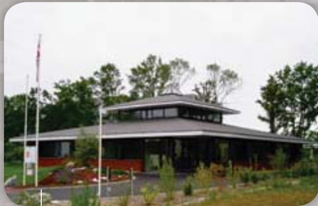
Imprimerie | Bordeaux AlkorDesign® - 2003