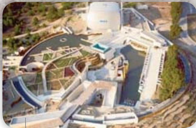
Centro Multimediale | Taranto AlkorPlan® L - 2002