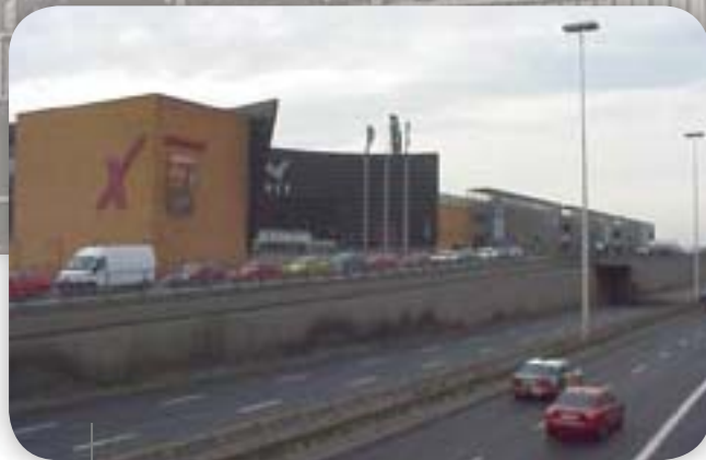
Fisketorvet Shopping Center | Copenhagen (Dk) AlkorPlan® F - 1999-2000