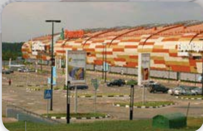
Trade entertainment center EUROPARK | Moscow AlkorPlan® F - 2004-2005